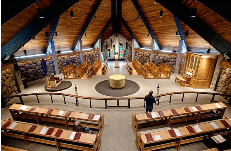
CHAPEL OF THE ABBEY OF THE GENESEE, GENESEO, NEW YORK